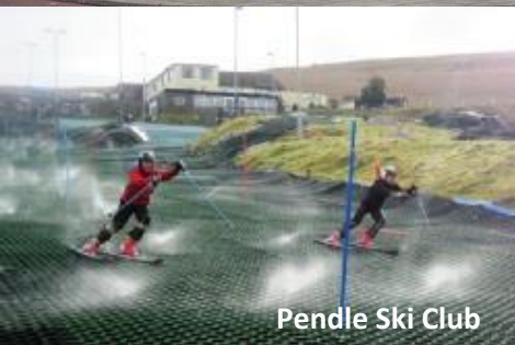
Pendle Ski Club