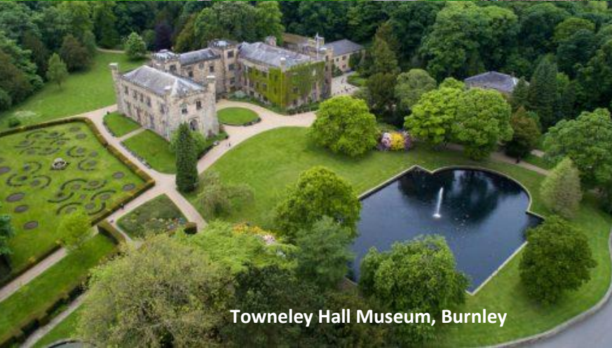
Towneley Hall Museum, Burnley