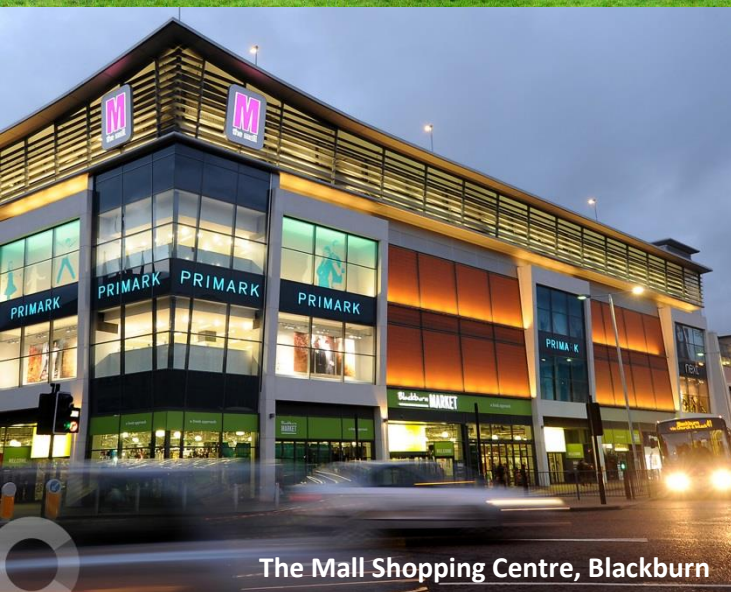
The Mall Shopping Centre, Blackburn