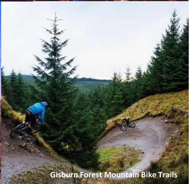
Gisburn Forest Mountain Bike Trails