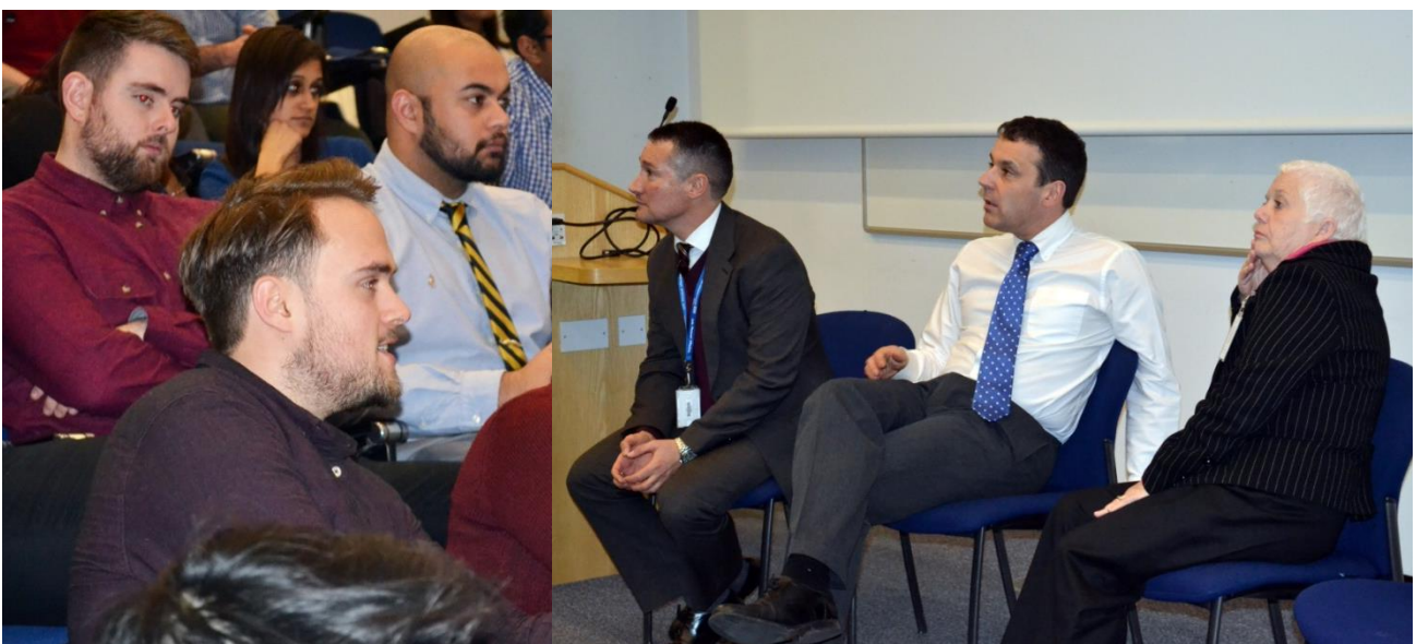
Picture: Chief Executive, Deputy Medical Director and Chairman in attendance at the FY2 Foundation Forum

The Postgraduate Department door is always open to any Junior Doctor seeking advice or support. We have three very approachable Foundation Programme Directors that are always available in any situation. Our Clinical Activity Support Team (CAST) are heavily involved in supporting Foundation Doctors throughout their training and are visible at ward handovers, foundation teaching and life support courses. Feedback on your training is really important to us and we hold regular Foundation Doctor Forums to gather thoughts on your experience at ELHT. The Chief Executive, Chairman and Medical Director regularly attend these to give the opportunity for direct feedback to the Trust Board.