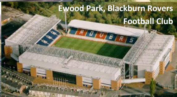
Ewood Park, Blackburn Rovers Football Club