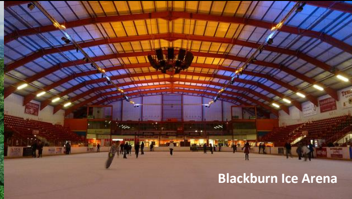
Blackburn Ice Arena