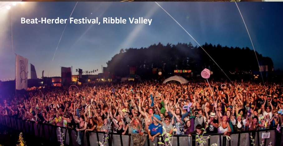
Beat-Herder Festival, Ribble Valley