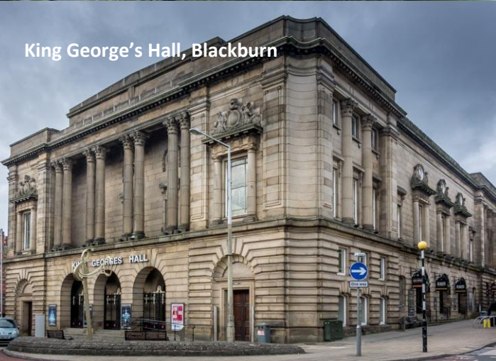
King George's Hall, Blackburn