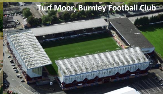
Turf Moor, Burnley Football Club