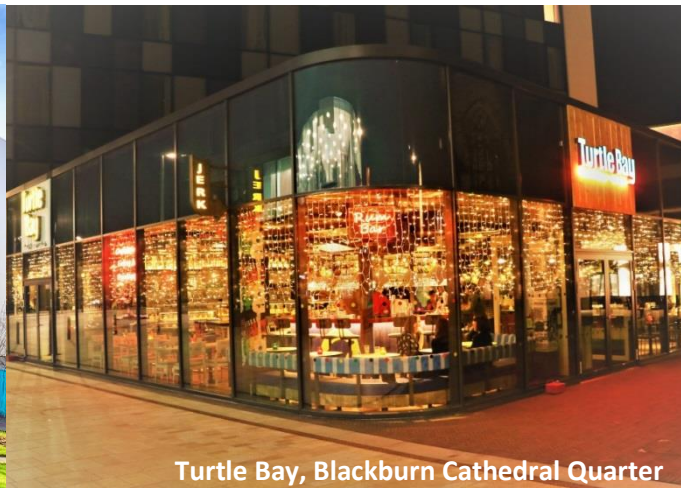
Turtle Bay, Blackburn Cathedral Quarter