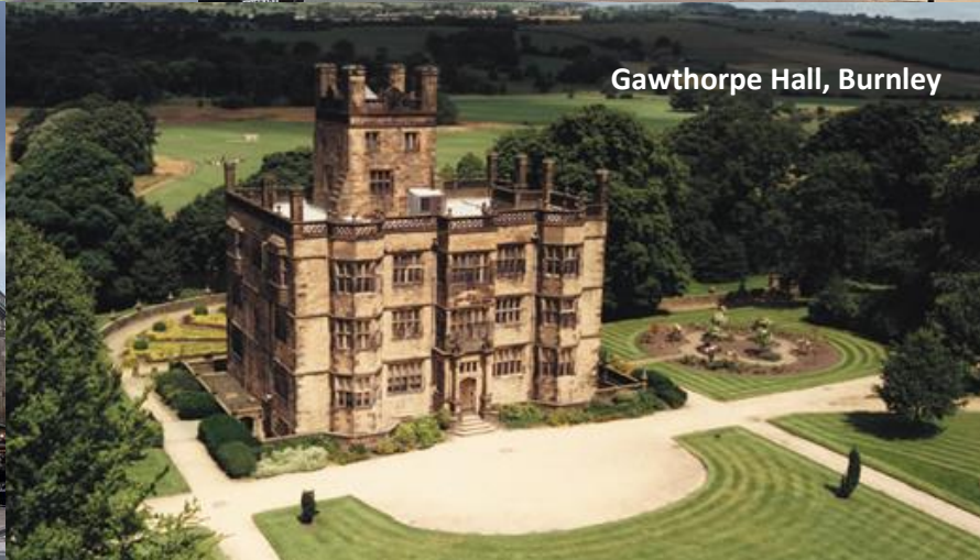
Gawthorpe Hall, Burnley