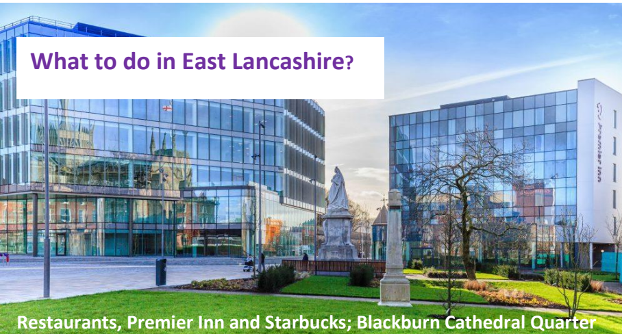
Restaurants, Premier Inn and Starbucks; Blackburn Cathedral Quarter